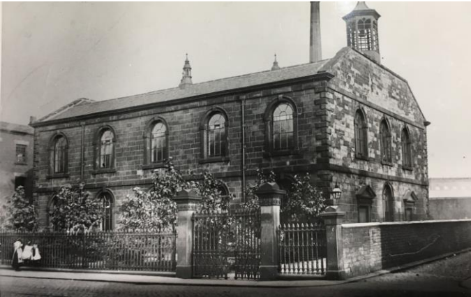
St John 's Chapel-of-Ease on the Rock