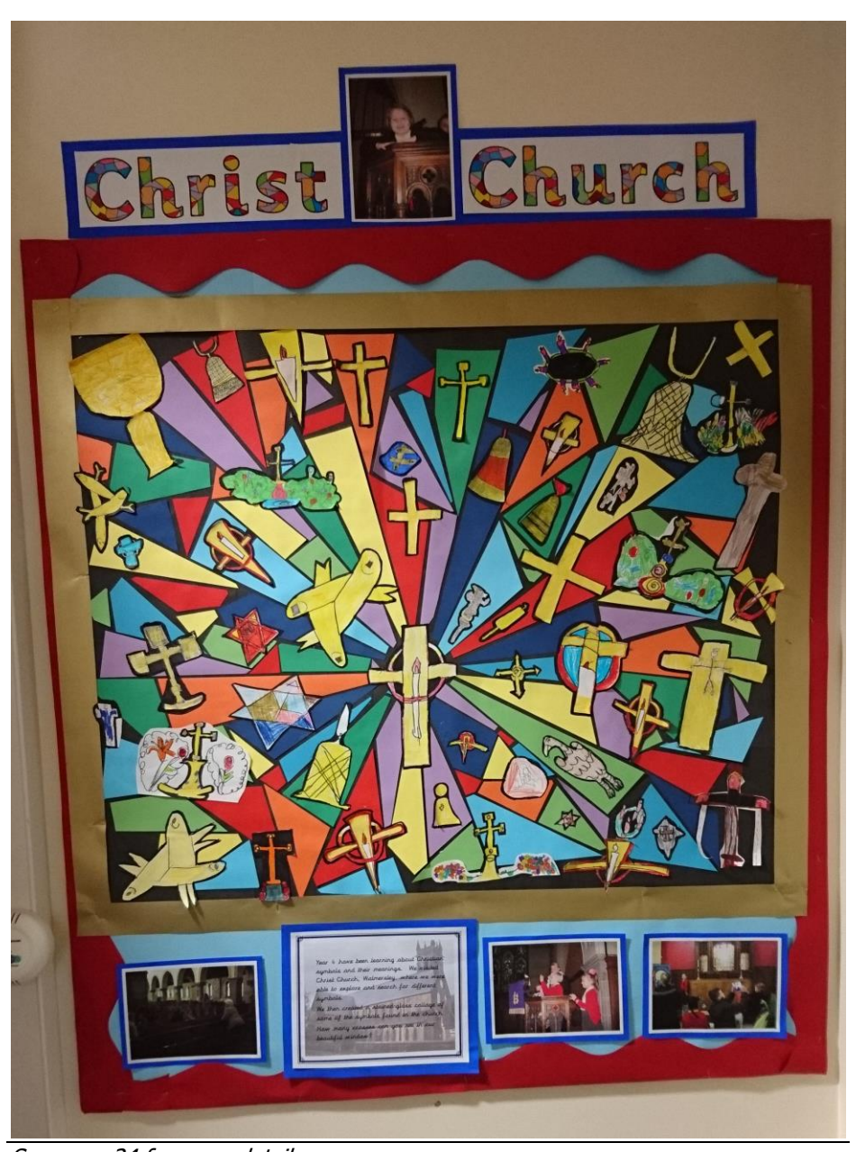
See page 24 for more details.