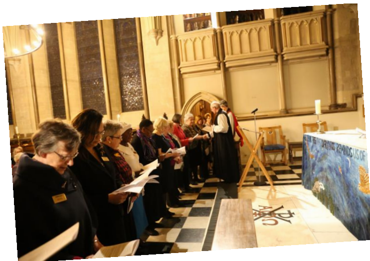
Mothers' Union Worldwide Trustees commissioned at Lambeth Palace on St David's Day (see page 24)