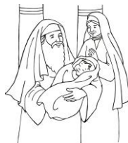
Simeon and Anna Thank God (Luk 2)

Lord, now you let your servant go in peace, your word has been fulfilled: My own eyes have seen the salvation, which you have prepared in the sight of every people: a light to reveal you to the nations and the glory of your people Israel.