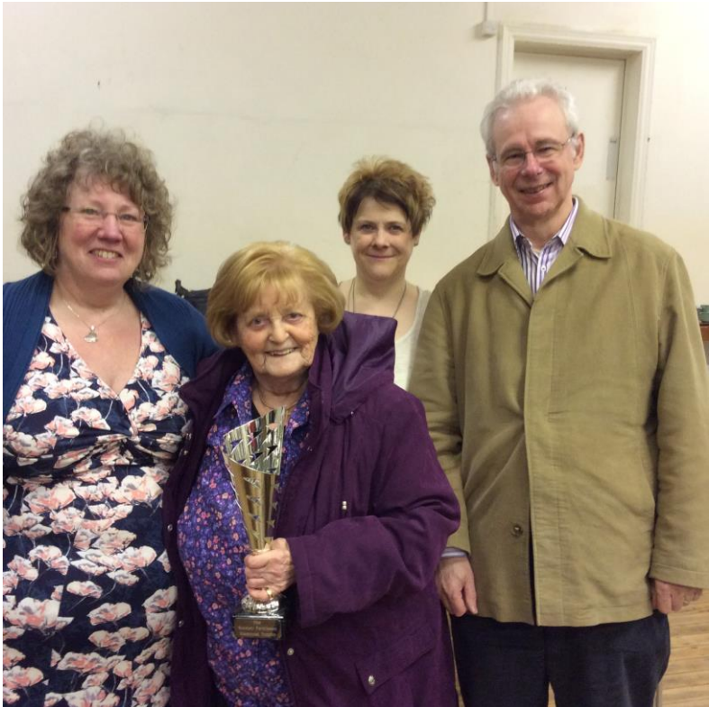
The Stanley Parkinson trophy winners 2015