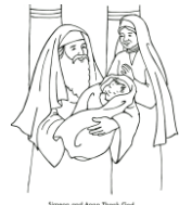
Simeon and Anna Thank God Luke 2

To be a light to lighten the Gentiles : and to be the glory of thy people Israel.