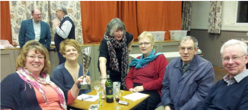
The first winners to receive this magnificent trophy, given in memory of a great quizmaster, – a rather moving moment