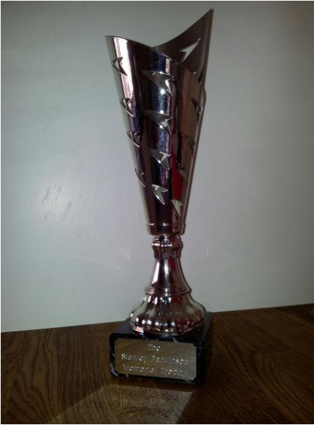
The Stanley Parkinson Memorial Trophy