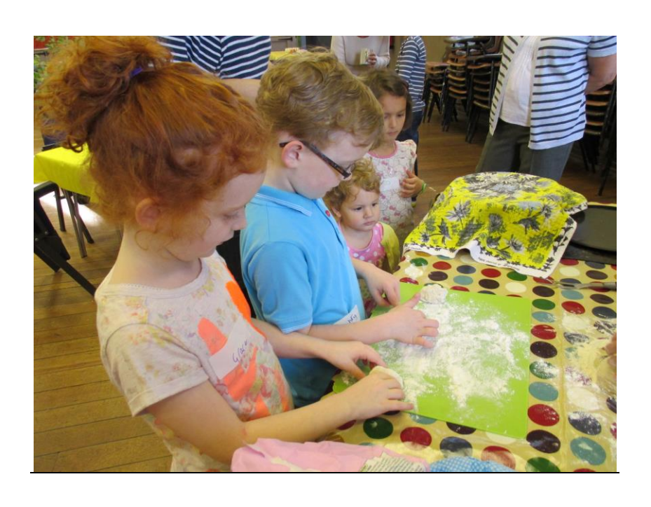
Making bread rolls to eat with our ploughman's lunch