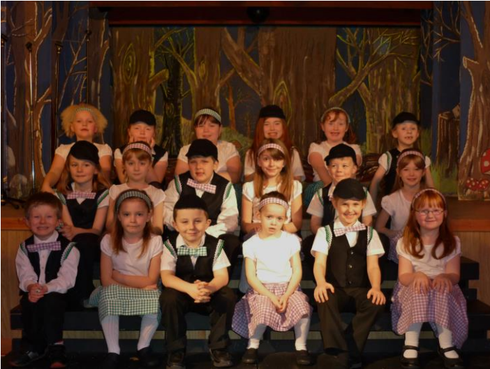
Members of the cast