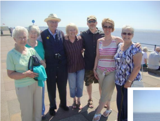
Parish Retreat – trip to Crosby Beach