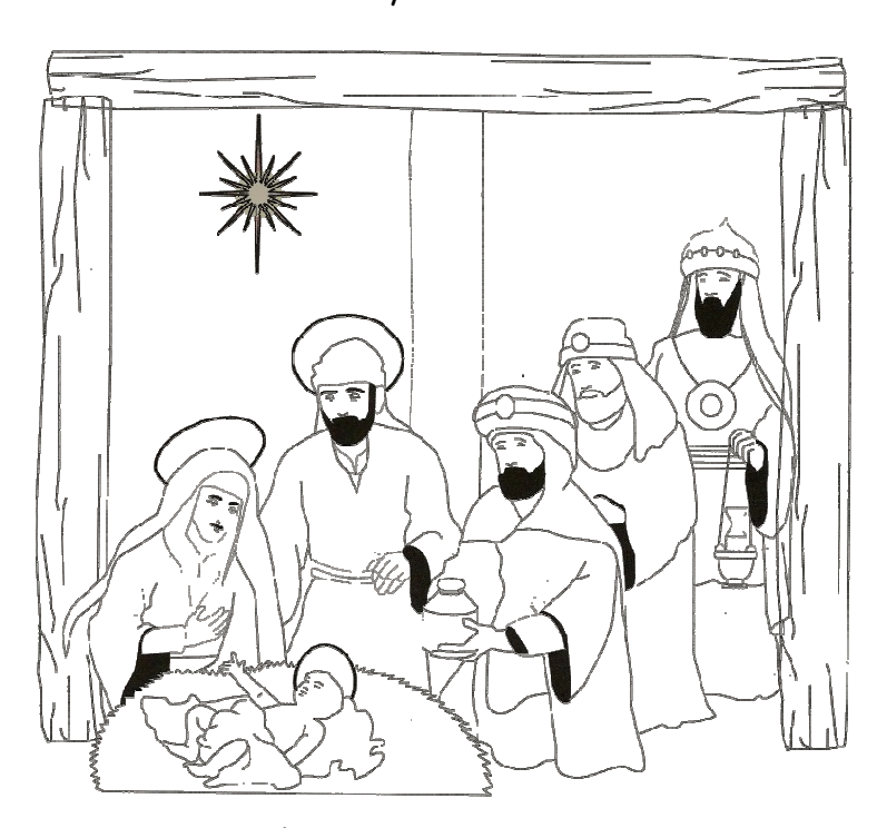
A picture to colour

The lights are so spectacular, Please wipe away that tear. For I am spending Christmas With Jesus Christ this year.