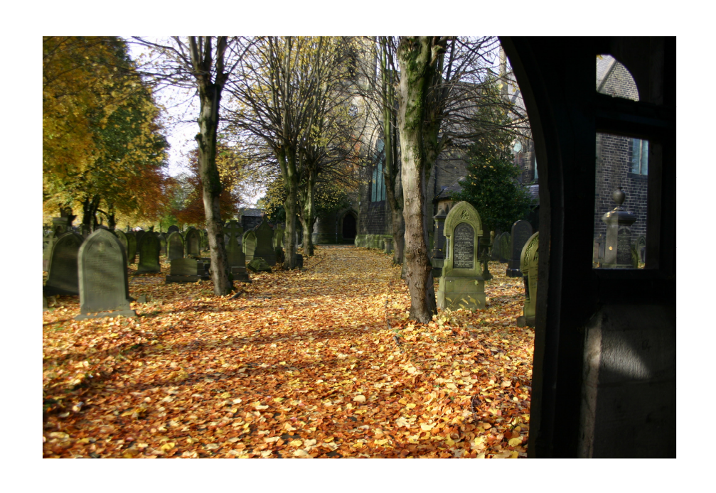
. Season of mists and mellow fruitfulness