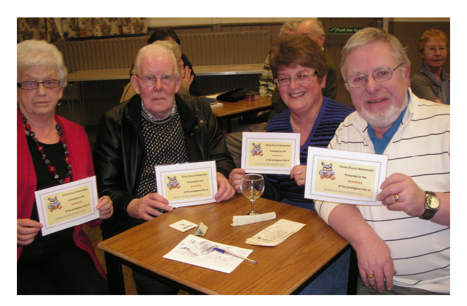
and they were pleased, really!